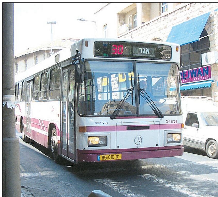
A number of young people hung signs around Israel last week in protest of the separation between men and women on public transport in Jerusalem.

"The ministerial committee that was established by High Court request ruled unequivocally that the segregation must